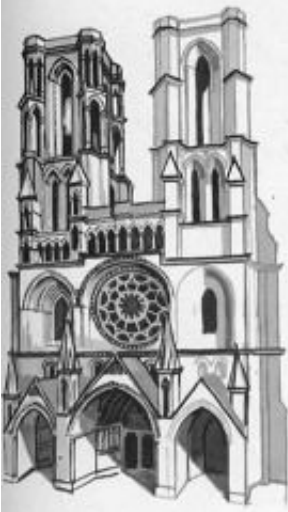
Laon Cathedral, c.1235