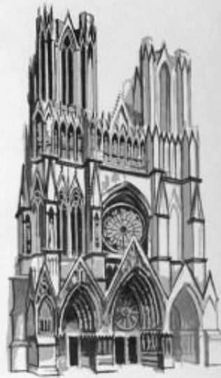
Rheims Cathedral, c.1255-c.1290